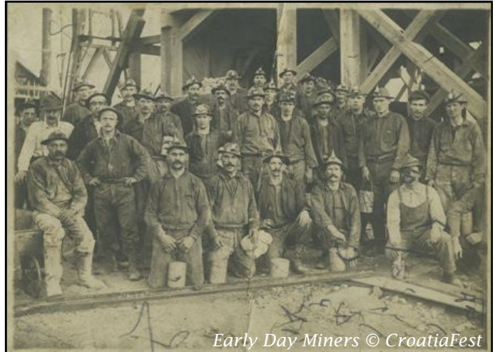
Early Day Miners

The first Croatian Fraternal Union (CFU) lodge in the Pacific states, "Dr. David Starčević" - Lodge 56," was formed in Roslyn in 1897. By 1904 Lodge 56 was the largest CFU lodge in the entire CFU network. Succeeding years saw the formation of several more Croatian Lodges which eventually all merged with Lodge 56. Lodge life played a significant role in the lives of the area's early Croats.