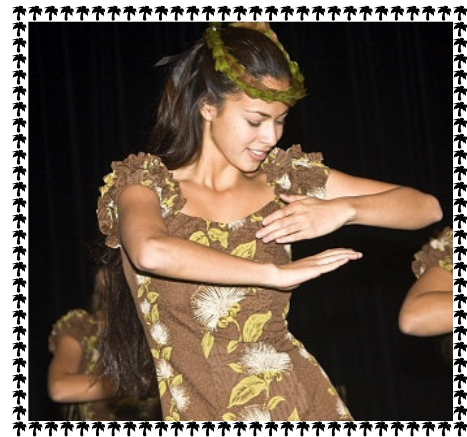
Live Aloha! Hawaiian Cultural Festival September 7, 11am-7pm Seattle Center House